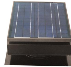
Model #SF-30 Roof mount