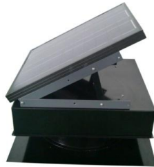
Model #SF25 Roof mount