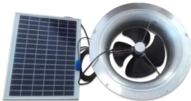
Model # SGF20 Gable mount